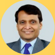
CA Suresh Prabhu, Former Cabinet Minister, Former G20 & G7 Sherpa