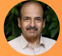
NS Vishwanathan, Former Deputy Governor of Reserve Bank of India